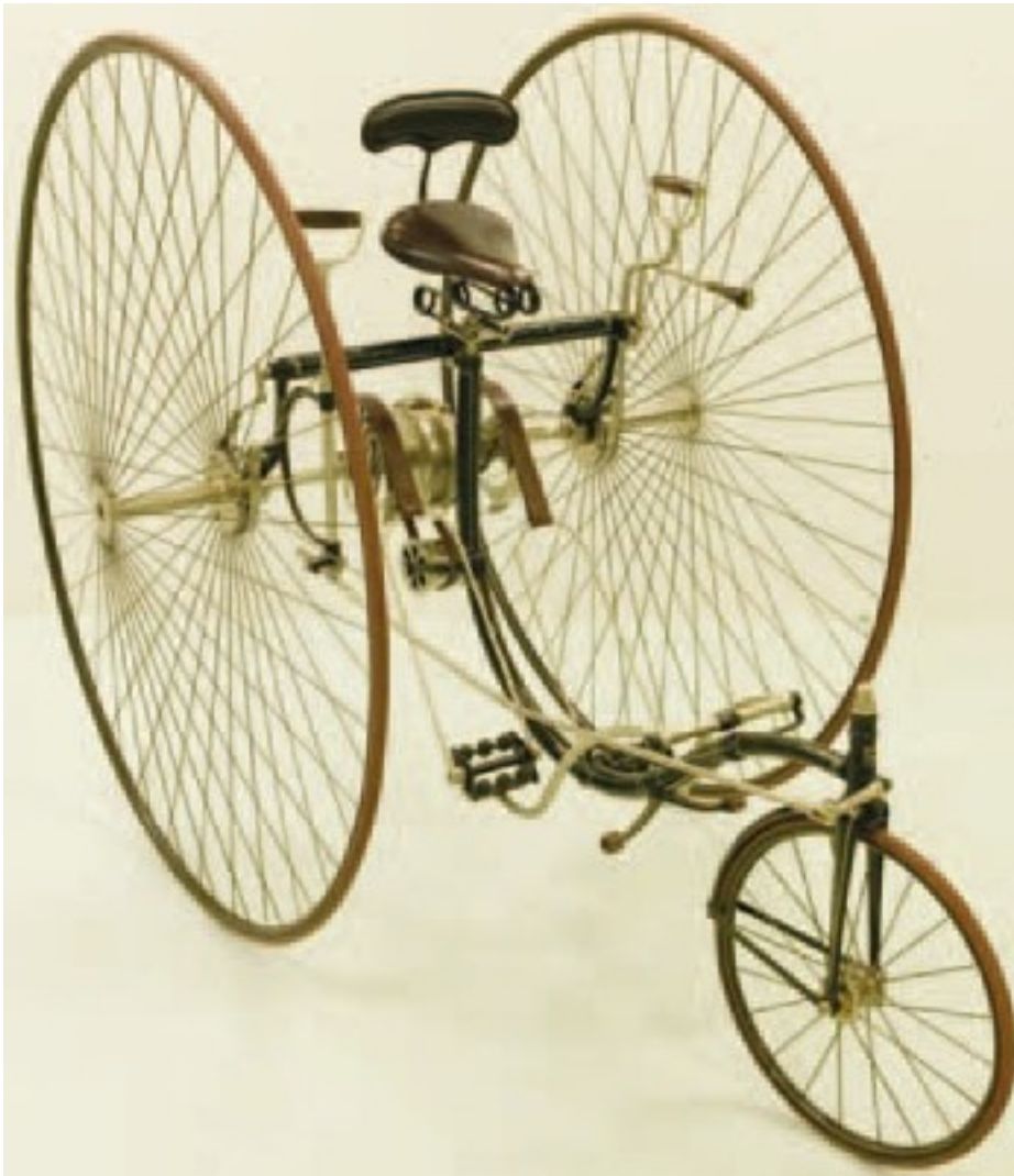
Treadle powered omnicycle 1870s-80s, donated to Museum Victoria