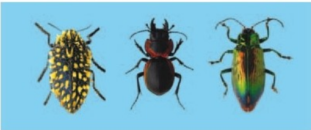
Oological collection donated to the CSIRO Beetle collection donated to the Tasmanian Museum and Art Gallery